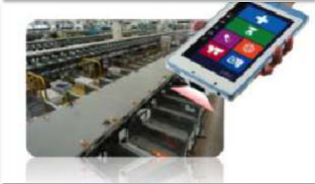
Assembly Line Management