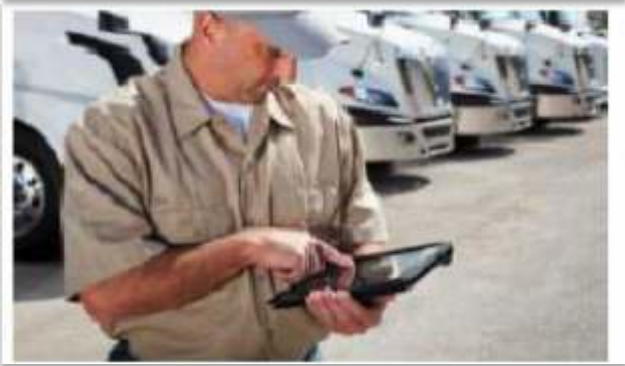
Automation Control Panel